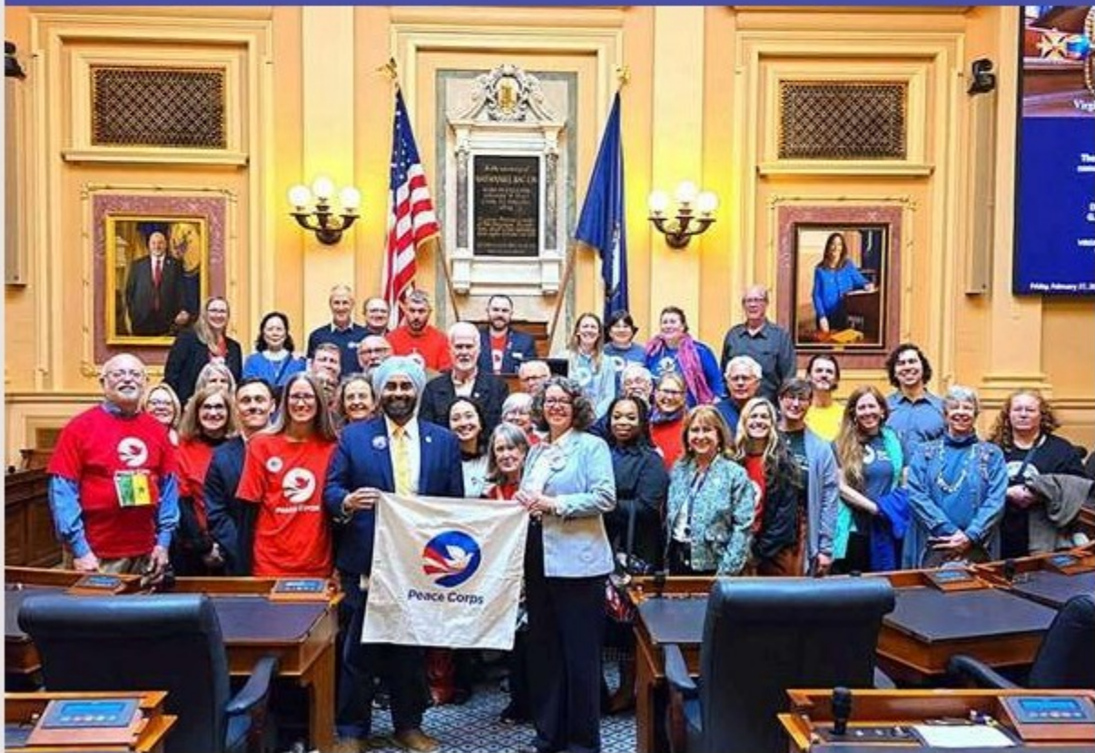
Celebrating Peace Corps!

Live feed | Northern Virginia Returned Peace Corps Volunteers (NOVA RPCV)